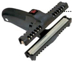
Hand Operated, Constant Heat 6" Seal Width Teflon Seal Surface