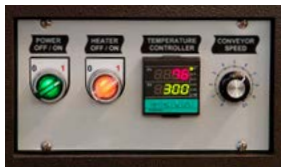
Tunnel Control Panel